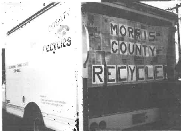
The newly-acquired Morris County/OTC van is appropriately decorated for its christening ceremony.