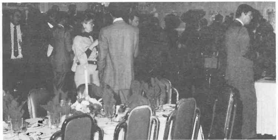
Guests at the first Morris County Recycling Awards Dinner.

It was decided by the MCRAC that a list of recycling collection companies who have complied with the County's District Recycling Plan and have fulfilled municipal quarterly report requirements would be compiled for distribution. The criteria for meeting these objectives requires that listed companies comply with the County's District Recycling Plan. The listing should be completed early in 1989.