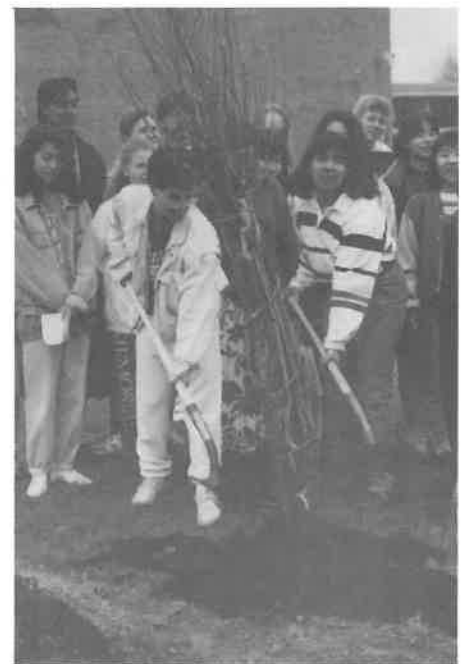
A tree grows at Whippany Park High School. Members of SEEK (Science and Environmental Education Klub) participate in the Marcal Plant-A-Tree Program. Marcal Paper Mills, Inc., Elmwood Park, donated five trees to Morris County to acknowledge the County for the magazines and junk mail accepted at the Recycling Consolidation Center. These are then reprocessed into consumer paper products through Marcal's "Paper From Paper, Not From Trees" system. Whippany Park High was chosen as the site because SEEK is currently involved in an extensive tree-planting project.