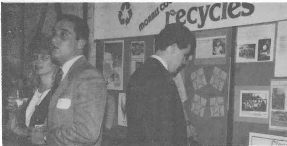
DURING . . . Dinner guests have the opportunity to sample some libations and to look at the Morris County recycling display.