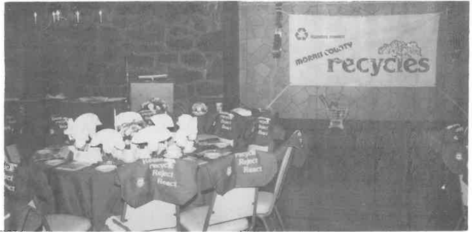
BEFORE . . . Re-usable cloth shopping bags which served as table favors are draped over the backs of chairs patiently awaiting the arrival of guests who will put them to