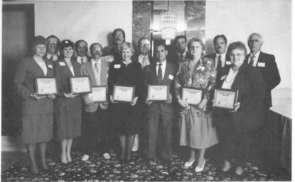
Above: Representatives of the municipalities which increased their recycling tonnage by a minimum of 10% between 1991 and 1992 pose with their certificates of achievement.