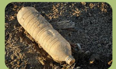
Clean, recyclable litter Contaminated, unrecyclable litter