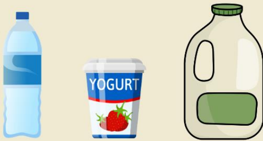
PLASTIC (CODED #1 & #2)