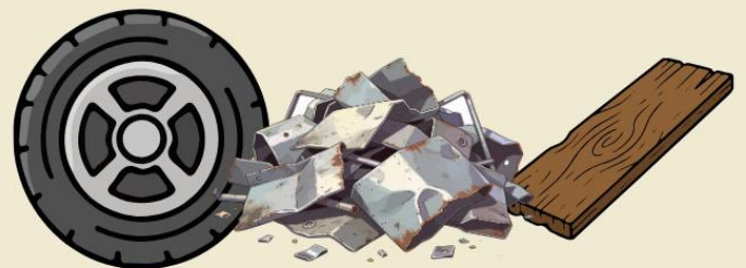
TIRES, SCRAP WOOD*, METAL* (MUST BE RECYCLED AT SPECIAL OUTLETS, CANNOT GO IN BIN)