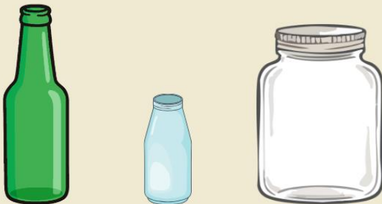
GLASS (BOTTLES & JARS)