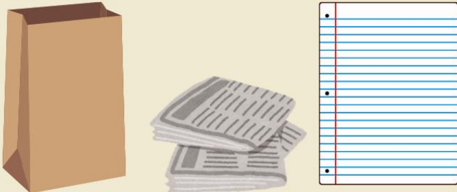
PAPER (MUST BE DRY)

The following items are universally recyclable in New Jersey. Check with your recycling program if additional materials are recyclable. All littered tires must be recycled, whereas scrap metal and wood are recommended. Check with your local DPW if they are acceptable or find alternative outlets on the MCMUA website.