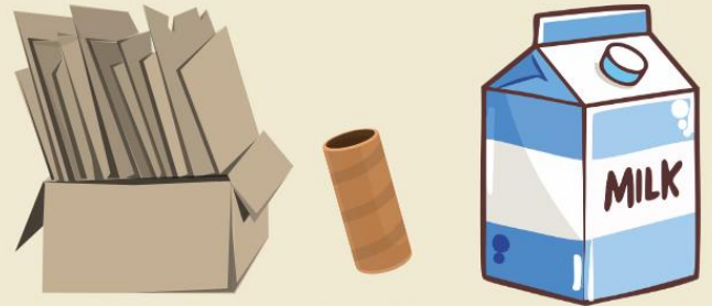
CARDBOARD (MUST BE DRY)